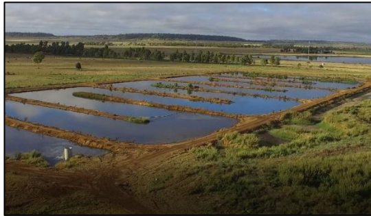
Maturation Pond Image: NB Foods, Oakey