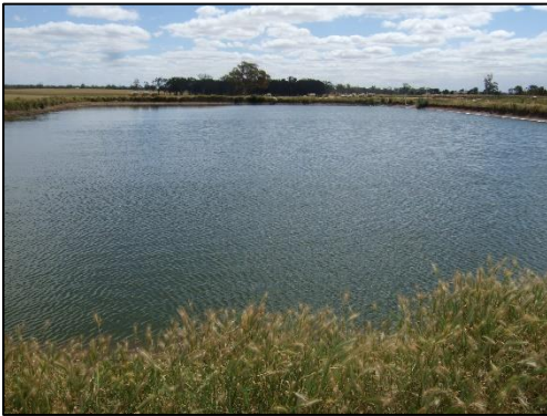
Facultative Pond